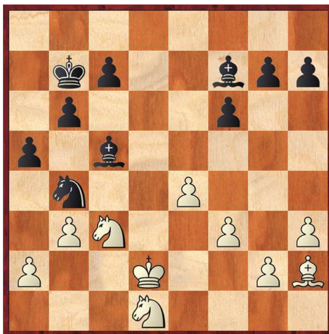
Position after 29...Bh2

29.Bh2 (This B just does not seem to know where to go. And now what for Black?)